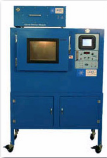
0500 with Catalytic Destruct Unit

The OREC™ Ozone Catalytic Destruct Units (CDUs) are designed for the OREC™ 0500 - 0900 series Ozone Chambers. The ozone that is discharged from the test chamber is “catalyzed” ... turning it back into oxygen, eliminating the need for complicated and costly external ducting. The CDUs are completely integral, self-contained units.